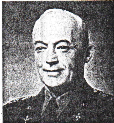
GEN. HENRY H. ARNOLD

GENERAL of the Air Force Henry H. Arnold learned to fly in 1911 at the school operated by the Wright brothers. Over the next 40 years he lived and breathed and fought for the development of military aviation in the US. During the Mitchell court-martial in 1925, "Hap" Arnold fought, often openly, in defense of his idol and his ideas. After the trial he was exiled to Fort Riley, Kan., but he came back.